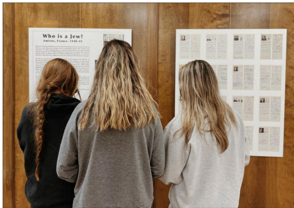
Duquesne University students view the exhibit "Who is a Jew? Amiens, France 1940-1945" on the fourth floor of Gumberg Library.

mutable, restrained performance of which he's capable. Audiences may not be entirely shocked by Jackson's choices as "Jockey" makes its way to the home stretch, but they'll nonetheless be surprised with how Collins makes them manifest. Like the horses Jackson has long dreamed of riding, "Jockey" begins by exuding modest promise, and winds up being a thoroughbred.